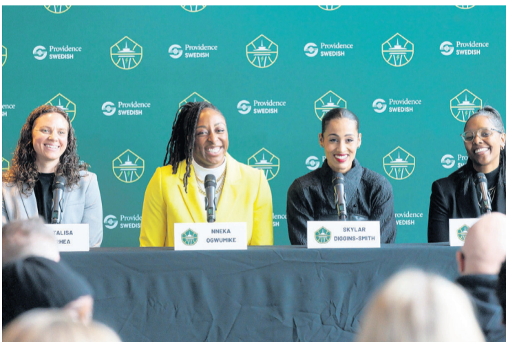
Seattle Storm General Manager Talisa Rhea, from left, players Nneka Ogwumike, Skylar Diggins-Smith and head coach Noelle Quinn talk at a press conference in Seattle, Monday, Feb. 19, 2024.